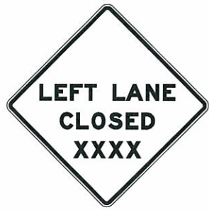
LEFT LANE CLOSED SIGN

W20-4 48 x 48 16.00 SF COLOR: LEGEND AND BORDER: BLACK (NON-REFLECTORIZED) BACKGROUND: FLUORESCENT ORANGE (REFLECTORIZED)