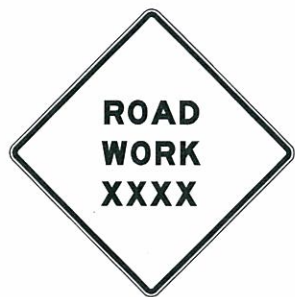
ROAD WORK SIGN

W20-1 48 x 48 16.00 SF COLOR: LEGEND AND BORDER: BLACK (NON-REFLECTORIZED) BACKGROUND: FLUORESCENT ORANGE (REFLECTORIZED)