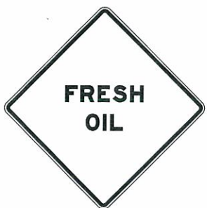
FRESH OIL SIGN

W21-1 48 x 48 16.00 SF COLOR: LEGEND AND BORDER: BLACK (NON-REFLECTORIZED) BACKGROUND: FLUORESCENT ORANGE (REFLECTORIZED)