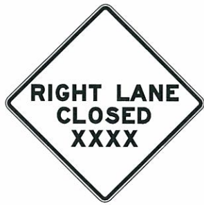
RIGHT LANE CLOSED SIGN

W20-5(L) 48 x 48 16.00 SF COLOR: LEGEND AND BORDER: BLACK (NON-REFLECTORIZED) BACKGROUND: FLUORESCENT ORANGE (REFLECTORIZED)