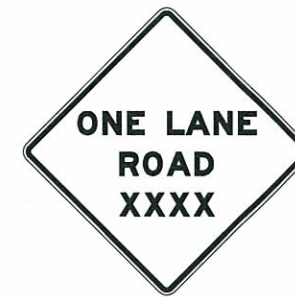
ONE LANE ROAD SIGN

W20-3A 48 x 48 16.00 SF COLOR: LEGEND AND BORDER: BLACK (NON-REFLECTORIZED) BACKGROUND: FLUORESCENT ORANGE (REFLECTORIZED)