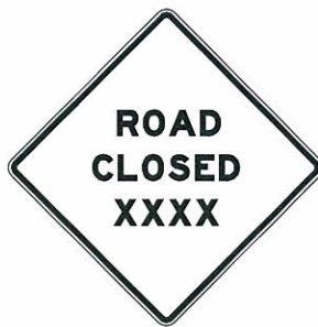
ROAD CLOSED SIGN

W20-2 48 x 48 16.00 SF COLOR: LEGEND AND BORDER: BLACK (NON-REFLECTORIZED) BACKGROUND: FLUORESCENT ORANGE (REFLECTORIZED)