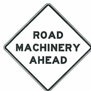
ROAD MACHINERY AHEAD SIGN

W21-2 48 x 48 16.00 SF COLOR: LEGEND AND BORDER: BLACK (NON-REFLECTORIZED) BACKGROUND: FLUORESCENT ORANGE (REFLECTORIZED)