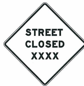
STREET CLOSED SIGN

W20-3 48 x 48 16.00 SF COLOR: LEGEND AND BORDER: BLACK (NON-REFLECTORIZED) BACKGROUND: FLUORESCENT ORANGE (REFLECTORIZED)