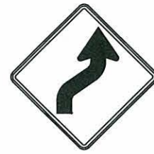
RIGHT REVERSE CURVE

COLOR: SYMBOL AND BORDER: BLACK (NON-REFLECTORIZED) BACKGROUND: FLUORESCENT YELLOW (REFLECTORIZED)