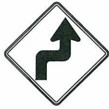
RIGHT REVERSE TURN

COLOR: SYMBOL AND BORDER: BLACK (NON-REFLECTORIZED) BACKGROUND: FLUORESCENT YELLOW (REFLECTORIZED)