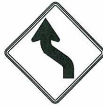
LEFT REVERSE CURVE

COLOR: SYMBOL AND BORDER: BLACK (NON-REFLECTORIZED) BACKGROUND: FLUORESCENT YELLOW (REFLECTORIZED)