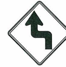
LEFT REVERSE TURN

COLOR: SYMBOL AND BORDER: BLACK (NON-REFLECTORIZED) BACKGROUND: FLUORESCENT YELLOW (REFLECTORIZED)