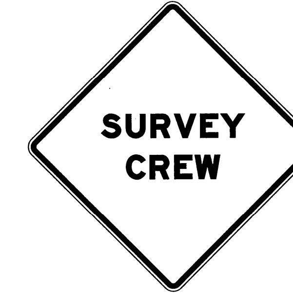
SURVEY CREW SIGN

COLOR: LEGEND AND BORDER: BLACK (NON-REFLECTORIZED) BACKGROUND: FLUORESCENT ORANGE (REFLECTORIZED)