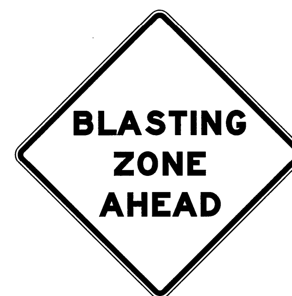
BLASTING ZONE AHEAD SIGN

COLOR: LEGEND AND BORDER: BLACK (NON-REFLECTORIZED) BACKGROUND: FLUORESCENT ORANGE (REFLECTORIZED)