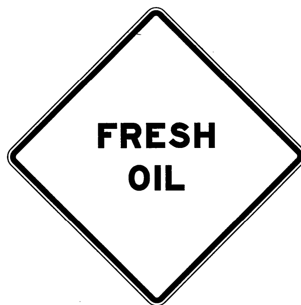
FRESH OIL SIGN