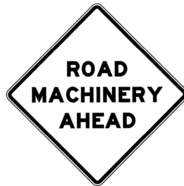
ROAD MACHINERY AHEAD SIGN

COLOR: LEGEND AND BORDER: BLACK (NON-REFLECTORIZED) BACKGROUND: FLUORESCENT ORANGE (REFLECTORIZED)