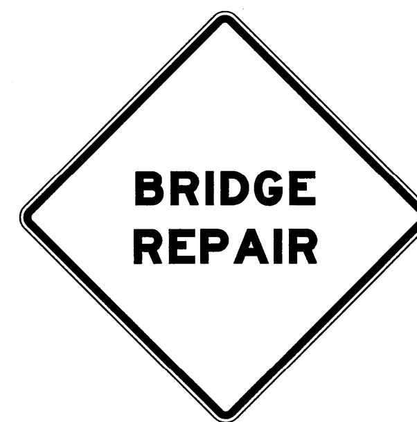
BRIDGE REPAIR SIGN

COLOR: LEGEND AND BORDER: BLACK (NON-REFLECTORIZED) BACKGROUND: FLUORESCENT ORANGE (REFLECTORIZED)