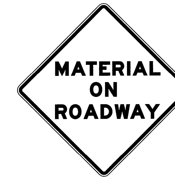
MATERIAL ON ROADWAY SIGN

COLOR: LEGEND AND BORDER: BLACK (NON-REFLECTORIZED) BACKGROUND: FLUORESCENT ORANGE (REFLECTORIZED)