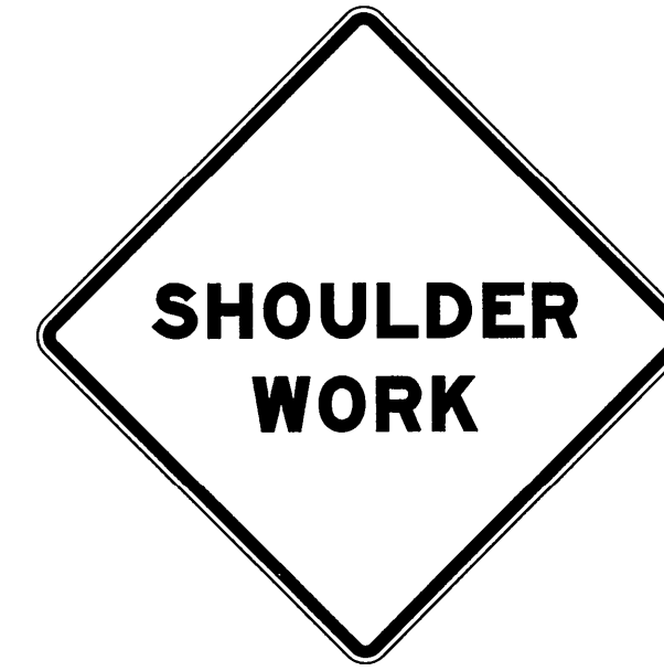
SHOULDER WORK SIGN

COLOR: LEGEND AND BORDER: BLACK (NON-REFLECTORIZED) BACKGROUND: FLUORESCENT ORANGE (REFLECTORIZED)