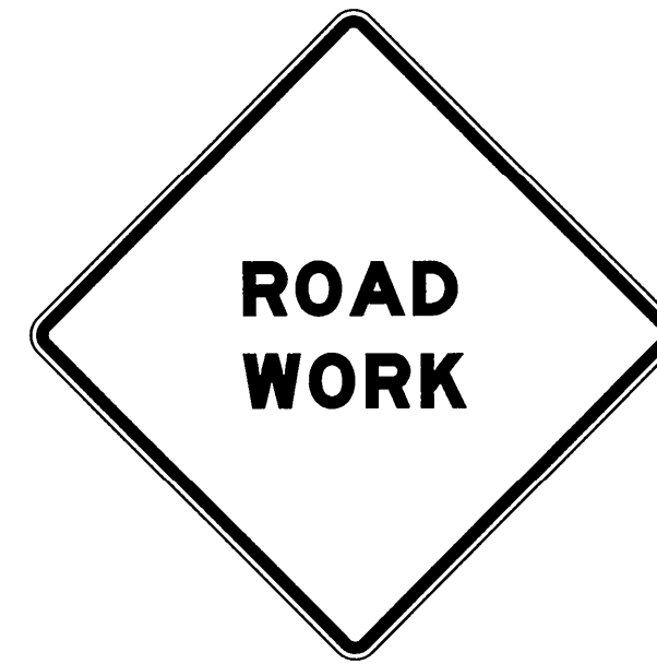
ROAD WORK SIGN

COLOR: LEGEND AND BORDER: BLACK (NON-REFLECTORIZED) BACKGROUND: FLUORESCENT ORANGE (REFLECTORIZED)