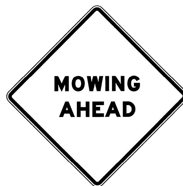
MOWING AHEAD SIGN

COLOR: LEGEND AND BORDER: BLACK (NON-REFLECTORIZED) BACKGROUND: FLUORESCENT ORANGE (REFLECTORIZED)