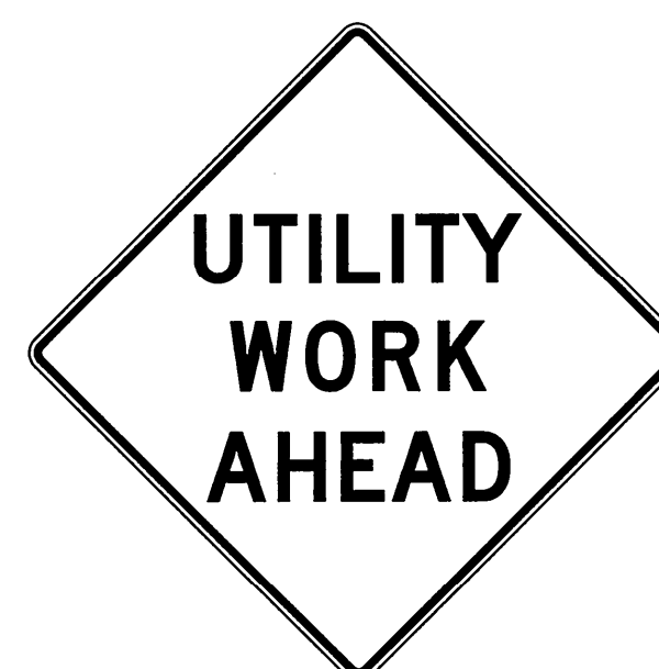
UTILITY WORK AHEAD SIGN

COLOR: LEGEND AND BORDER: BLACK (NON-REFLECTORIZED) BACKGROUND: FLUORESCENT ORANGE (REFLECTORIZED)