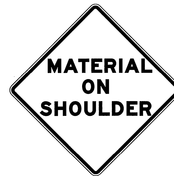
MATERIAL ON SHOULDER SIGN

COLOR: LEGEND AND BORDER: BLACK (NON-REFLECTORIZED) BACKGROUND: FLUORESCENT ORANGE (REFLECTORIZED)