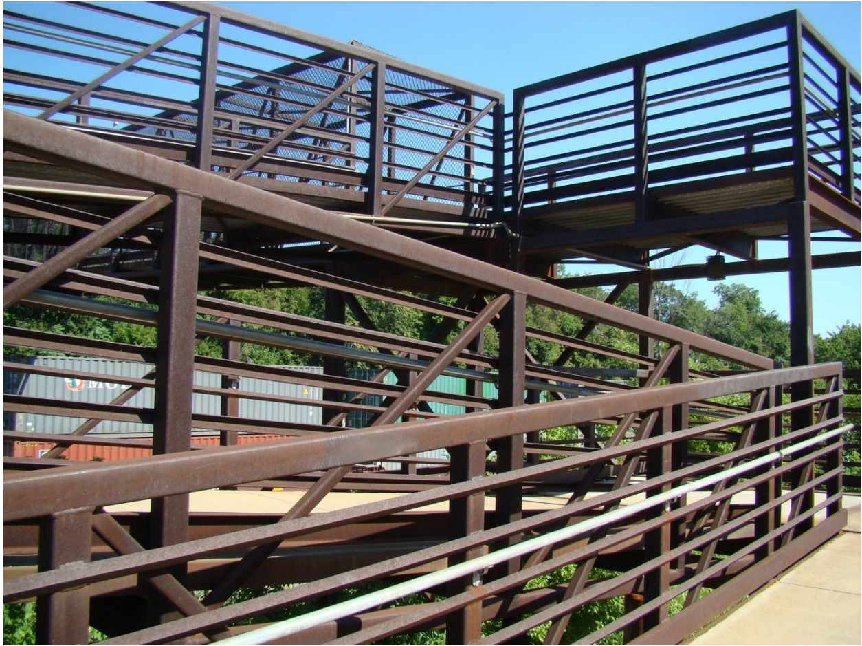
Figure 6 Switchbacks to Pedestrian/Bicycle Bridge Over BNSF RR Tracks

Date: 7/23/2009 Taken From: Pedestrian/Bicycle Bridge over BNSF Railroad Tracks Description: This bridge enables pedestrians and bicyclists to cross the BNSF railroad tracks to access the Newblock Park trail which connects with the Katy Trail to Sand Springs. This bridge crosses the BNSF tracks as well as the Sand Springs Railroad interchange tracks.