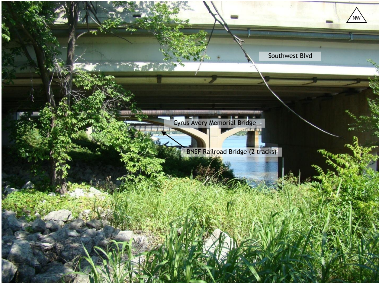
Figure 8 West Bank at the River Parks Trail