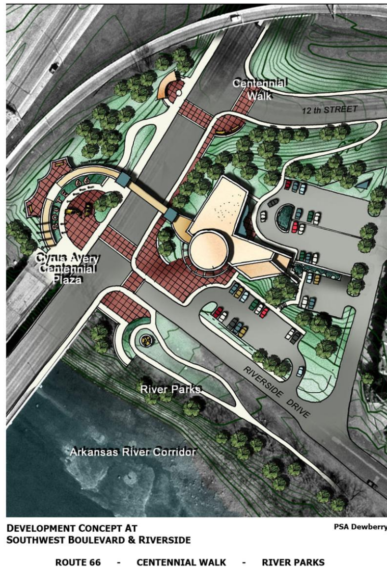
Figure 7 Layout of Route 66 Interpretive Center (future)

Description: The Route 66 Interpretive Center which is now under design will be a $10 million facility featuring Historic Route 66 information. Currently, the bridge and Cyrus Avery Centennial Plaza are completed.