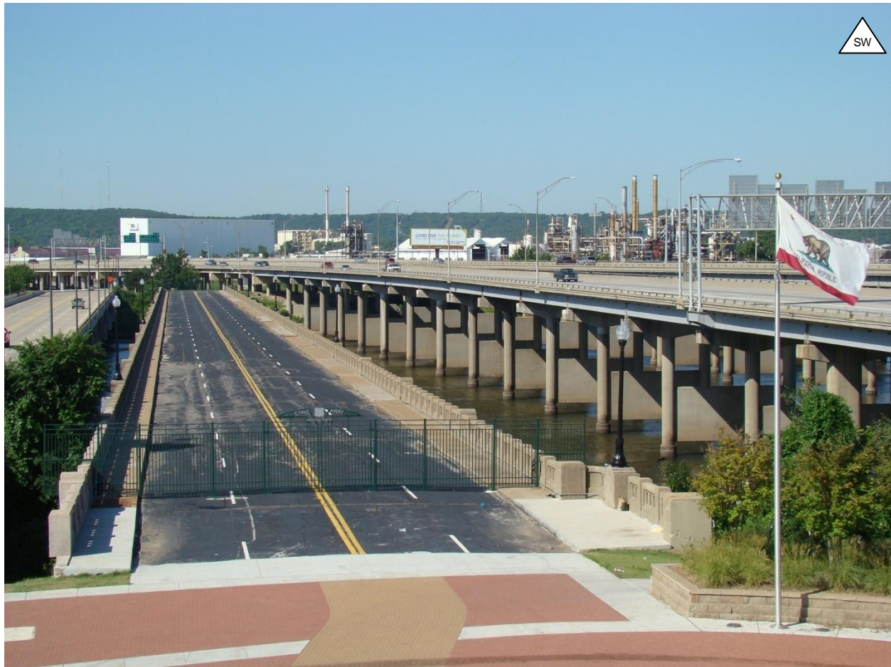
Figure 4 Cyrus Avery Route 66 Memorial Bridge and I-244