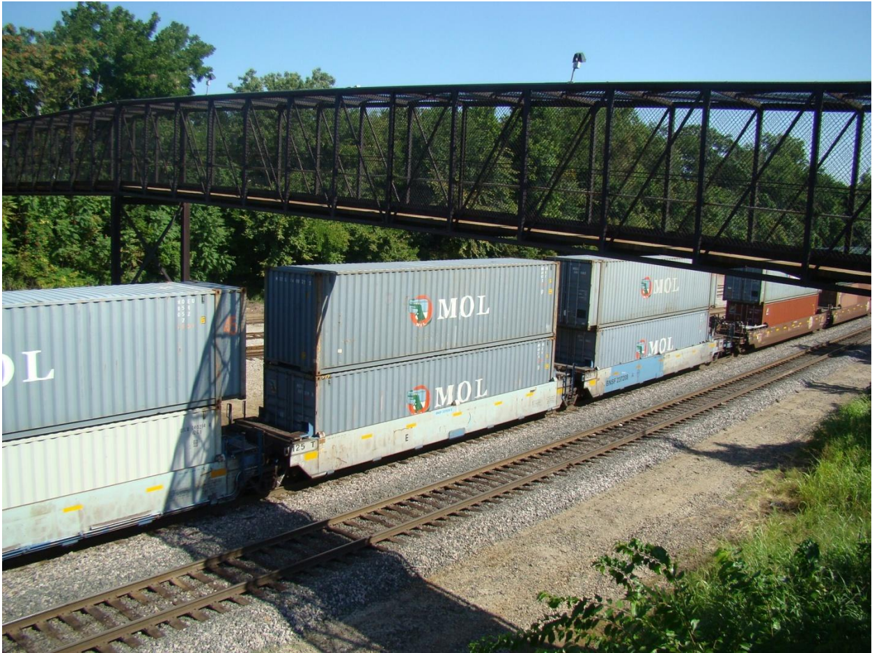
Figure 5 Pedestrian Bridge over BNSF Tracks

Date: 7/23/2009 Taken From: Newblock Trail Pedestrian Bridge Description: This bridge is required to have a 26' clearance to accommodate double stacked containers (pictured). Due to this height requirement, there must be switchbacks (see Figure 6). The retrofit of this bridge will accommodate rail transit on the approach to the Westbound bridge as shown in the I-244 Bundle document produced by Dr. Jack Crowley.