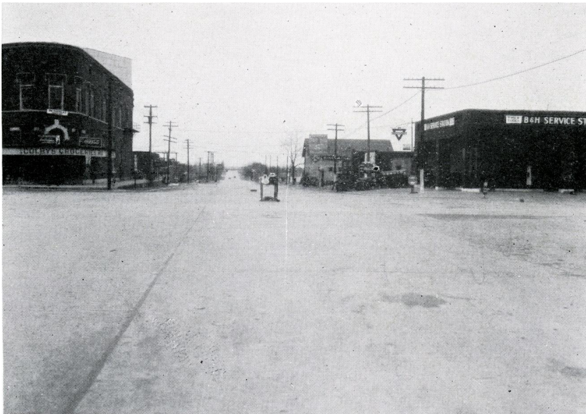
Photo 2 – A view of US-70 in Madill following a National Recovery Municipal paving project in 1934.