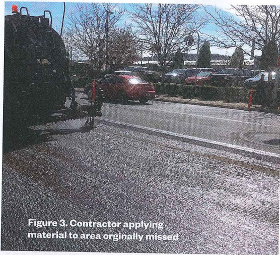
Figure 3. Contractor applying material to area originally missed