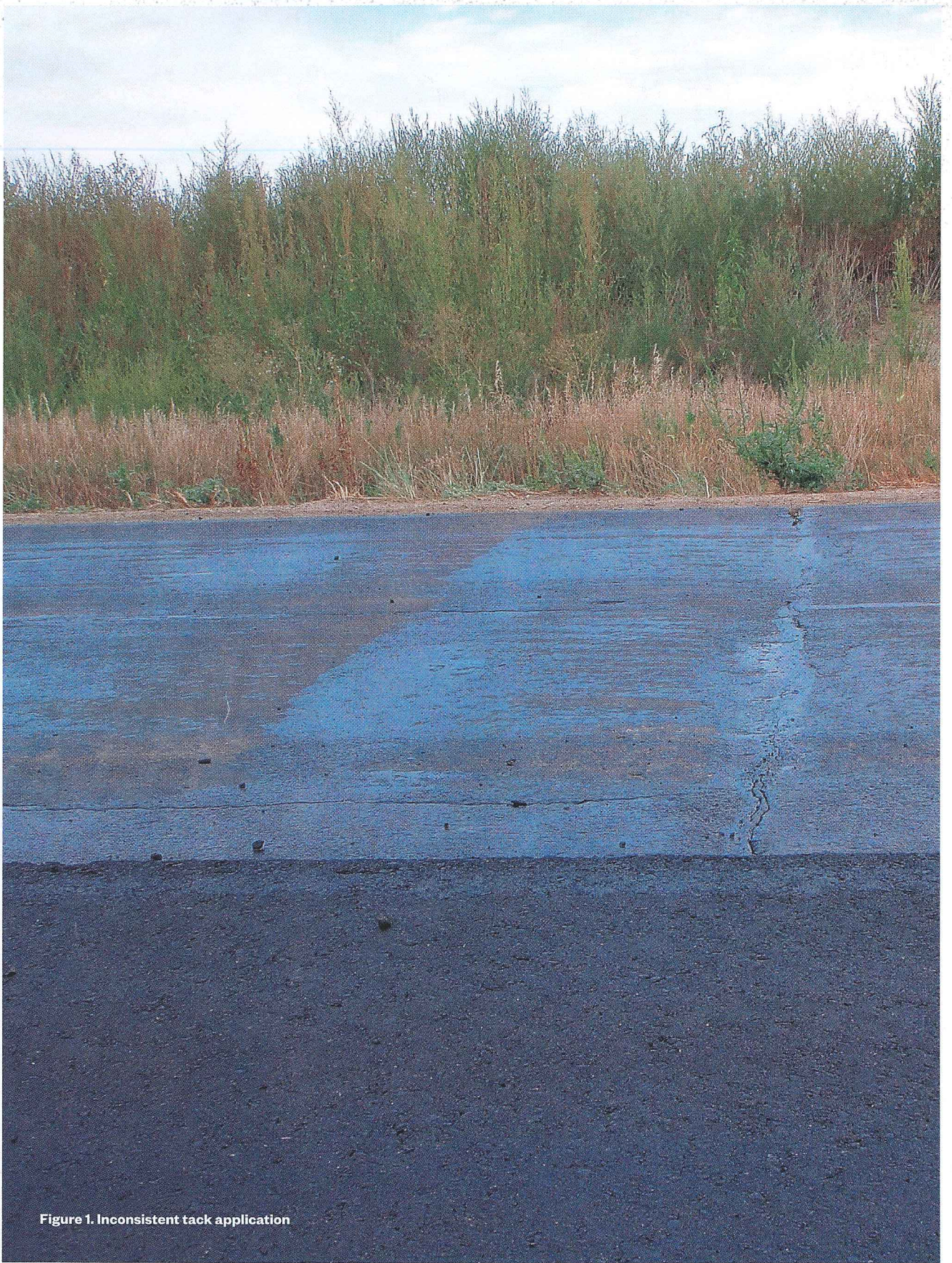
Figure 1. Inconsistent tack application