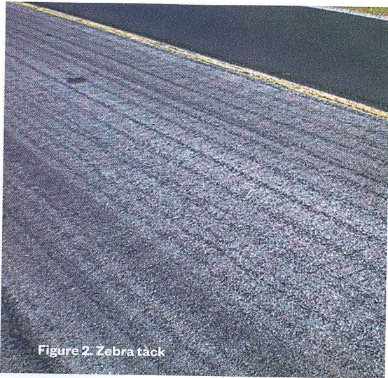
Figure 2. Zebra tack