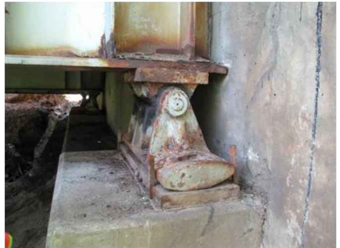
(b) On May 26, 2011