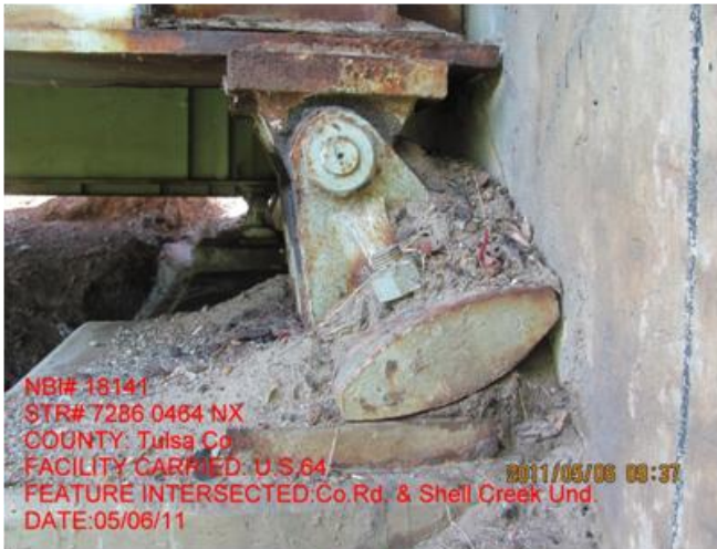
(a) On May 6, 2011