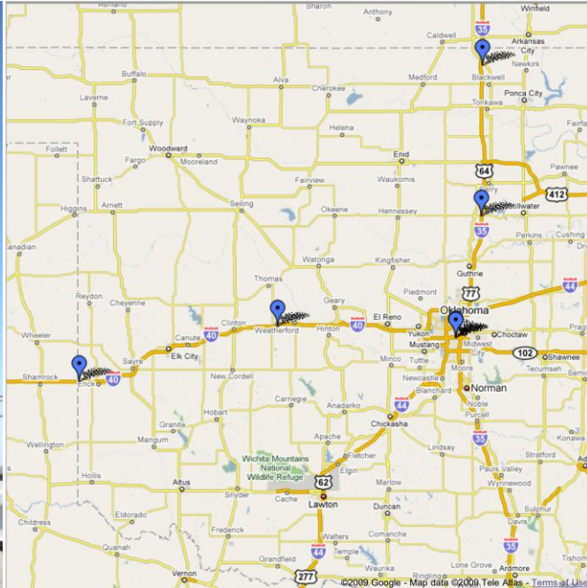
Figure 3: Location of the 6 deployed RWIS stations

2 shows the deployment of an RWIS station near Weatherford, OK being deployed by Vaisala, one of the two vendors of RWIS stations ODOT has currently deployed. This deployment was performed with consultation and participation of the OU ITS Lab Manager. We are further assisting ODOT in the evaluation of the deployed RWIS stations, manufactured from various vendors. Figure 3 shows the locations of the 6 RWIS sites deployed in Oklahoma at the end of Year 1 of this project. Note, two RWIS sites are co-located in Oklahoma City. Two different vendors have been contracted thus far to install RWIS stations along Oklahoma Highways, Vaisala and Surface Systems (SSI). By working with both of these vendors, we have established mechanisms to automatically retrieve RWIS sensor data from stations manufactured by Vaisala and are still working on retrieving data from those manufactured by SSI. Note that stations from each vendor feature different measurement capabilities, as well as how they are presented to us; Vaisala provides us XML data using the National Transportation Communications for ITS Protocol (NTCIP) [4]. A sample of this data is shown in Figure 4. SSI can only provide us with a website from which the data must be extracted and parsed. We have developed a MySQL database for the storage and retrieval of this sensor data.