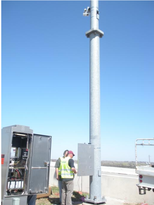
Figure 2: RWIS Deployment in Weatherford, OK