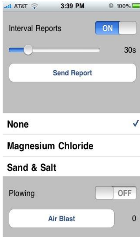
Figure 7: iPhone application used to simulate instrumented vehicles.

Instruments for these various measurements are, by necessity, custom to the vehicle being instrumented. The vehicles that are desirable to track during inclement weather consist of different types of vehicles (including plows and spreader trucks) with a variety of makes of each type. Additionally, many features will be missing from particular vehicles. For example, some trucks may not feature a movable plow, and some spreader vehicles always apply the same mix of salts and sand at the same rate.