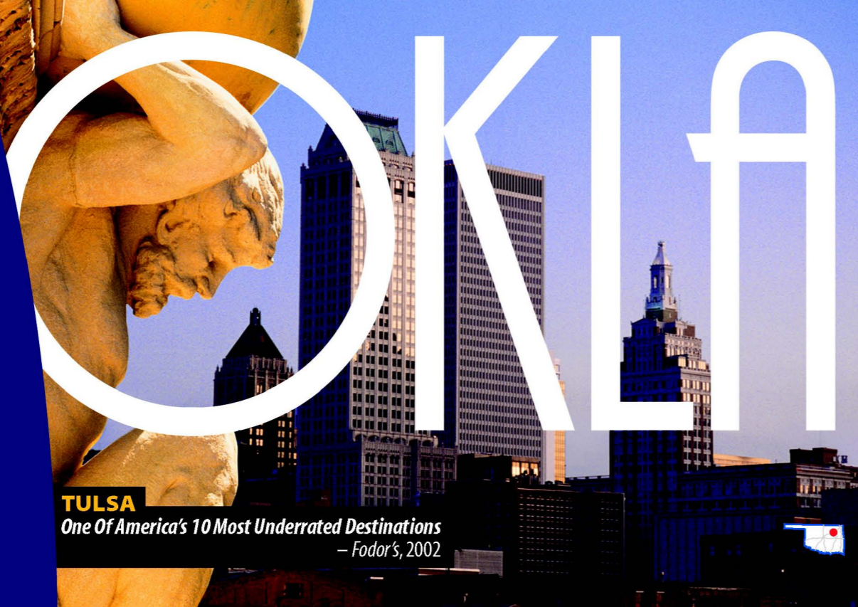
TULSA One Of America's 10 Most Underrated Destinations — Fodor's, 2002