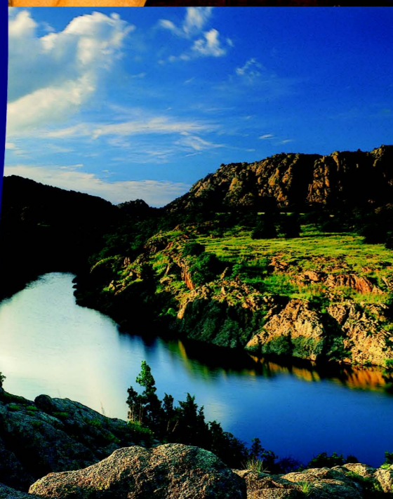
LAWTON America's First Wildlife Preserve: Wichita Mountains Wildlife Refuge