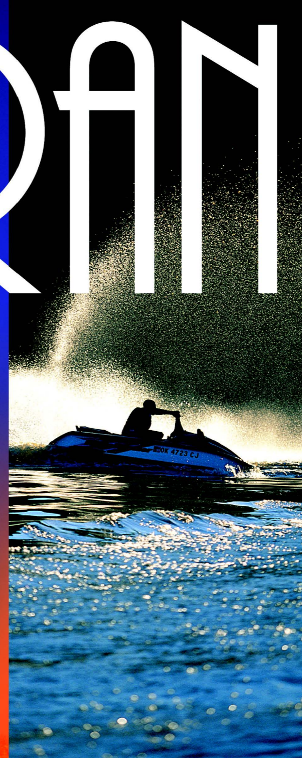
STATEWIDE More Miles Of Shoreline Than The East And Gulf Coasts Combined

Publicity rights to Frank Lloyd Wright's name, likeness, and work belong to the Frank Lloyd Wright Foundation, Scottsdale, Arizona. Used with permission.