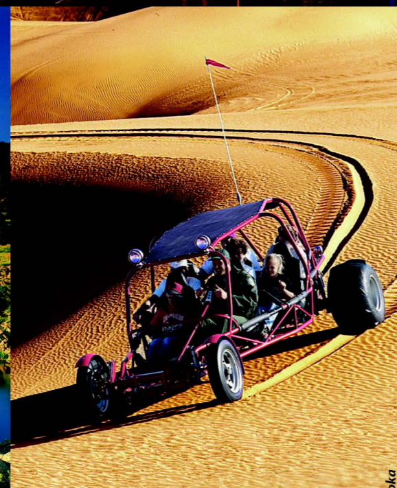
STATEWIDE America's Most Diverse Terrain — #1 EPA Ranking (mile-per-mile basis)