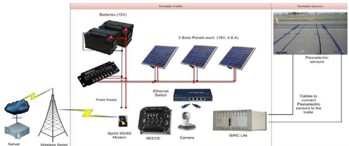
Figure 1 Portable Weigh-in-Motion System Architecture

RESULTS In this project, the portable WIM system uses off-the-shelf components and commercially available WIM controller, as illustrated in Figure 1. It was developed to provide an alternative WIM monitoring solution to permanent WIM systems and/or static scale stations, both of which are extremely expensive to install on highways. The portable WIM uses RoadTrax BL piezoelectric class-1 sensors, galvanized metal fixtures equipped with pocket tapes to house the sensors, and a trailer with cabinet to house WIM electronics, batteries, and REECE device for real-time monitoring. The system is solar powered with three 100-Watt panels. The total cost of system is $20,000.