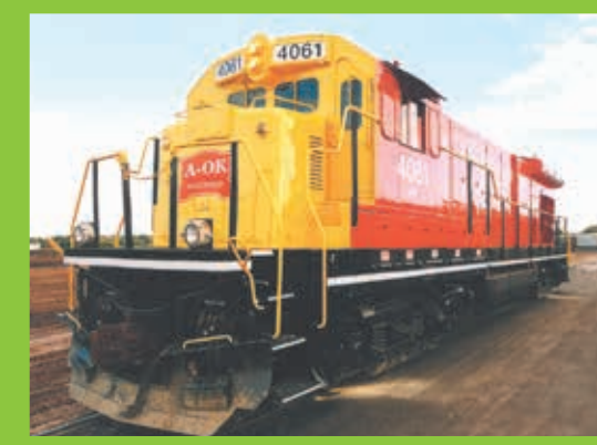
The Arkansas Oklahoma Railroad runs on part of an old Chicago, Rock Island & Pacific line, from McAlester to Howe, Oklahoma. They also provide freight service to the UP east along Shawnee to Oklahoma City trackage.