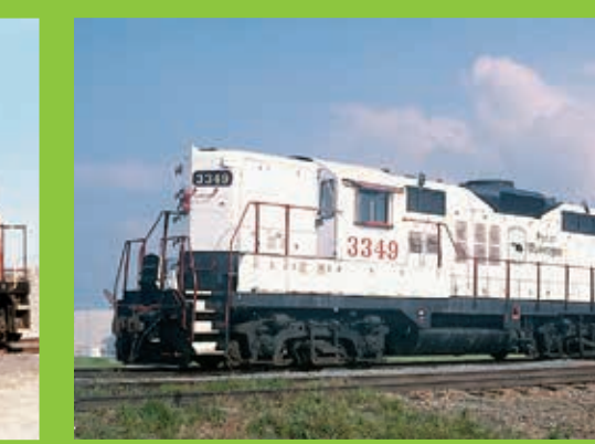
The Port of Muskogee Railroad works the loading docks and railway that services this inland port and its barges traveling along the Arkansas River Navigation System. This vital shipping link allows Oklahoma access to the growing world transport market.