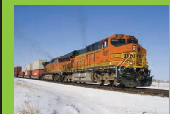
A BNSF Railway Company engine pulling an intermodal train north of Guthrie, Oklahoma. The BNSF is one of the largest railroads in the U.S., crossing more than half the counties in our state and serves as the host railroad to Amtrak's Heartland Flyer.