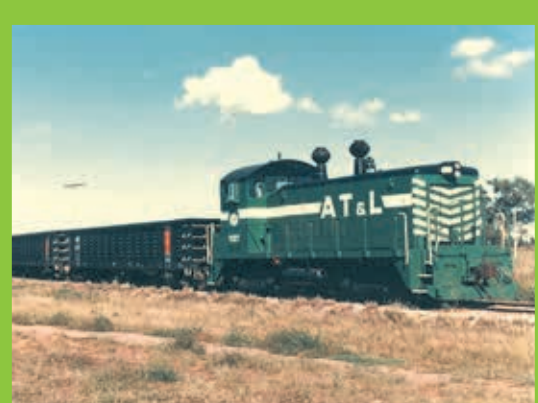
The Austin, Todd & Ladd Railroad operates over former Chicago, Rock Island & Pacific line primarily on their trackage from Watonga to El Reno. They took full ownership of the Geary to El Reno portion in 2014 ending the state lease-purchase successfully.