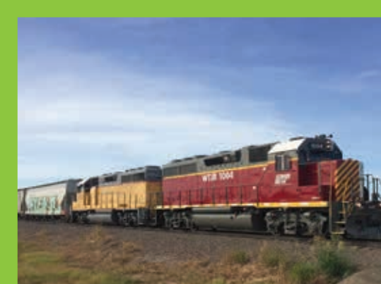
The Wichita, Tillman & Jackson Railway derived its name from two Oklahoma counties and its southernmost destination of Wichita Falls, Texas. This route was part of MKT's western OK branch line of the Katy (Missouri, Kansas & Texas Railroad) that once ran through both the Oklahoma and Texas panhandles.