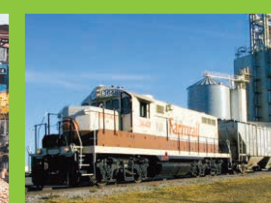
Farmrail Corporation was the first operator over state owned rail lines providing freight service to western Oklahoma since 1981. Farmrail also operates the 186 miles of the GrainBelt Corporation in 2013 they purchased the Sunbelt Line they'd leased for decades.