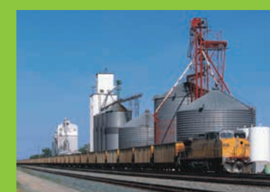
The Union Pacific Railroad connects Oklahoma's shortlines and major carriers to US markets west of the Mississippi. Its "unit train" approach uses 100+ cars to optimize fuel, car usage and destination options for the most economic means of transporting freight.