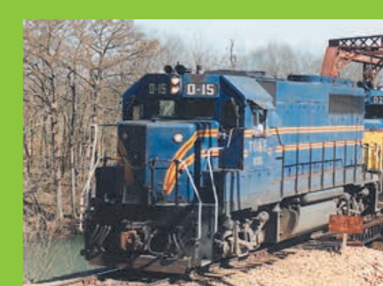
The Queen & Eastern Railroad of southeastern Oklahoma serves forest and timber related industries around McCurtain County linking up with its sister railroad, the De Queen & Eastern, connecting to the KCS just east of the Arkansas border.