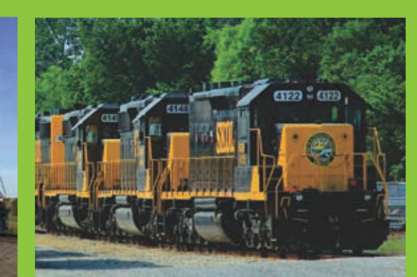
The South Kansas & Oklahoma Railroad, with trackage in much of two Oklahoma counties and its southernmost destination of Wichita Falls, Texas. This route was part of MKT's western OK branch line of the Katy (Missouri, Kansas & Texas Railroad) that once ran through both the Oklahoma and Texas panhandles.