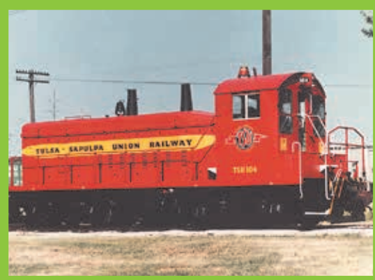
The Tulsa Sapulpa Union Railway is a commercial route that connects Sapulpa and eastern Tulsa communities light and heavy industry. First built as an interurban commuter train, its tracks run parallel to one of America's most famous highways - U.S. Route 66.