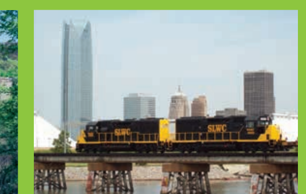
The Stillwater Central Railroad began operations on state owned tracks from Pawnee to Stillwater and Kansas. Continuing into Texas and Louisiana, it links major ports along the Gulf of Mexico with Oklahoma's eastern cities and forest industry.