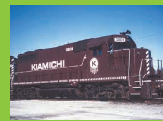
The Kiamichi Railroad, out of Hugo, Oklahoma provides rail service along the eastern Red River Valley. It links the area to other major carriers going north in Oklahoma, east in Arkansas, south into the Dallas-Fort Worth area and cities in northeastern Texas.