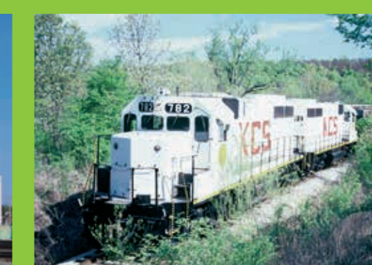
The Kansas City Southern Railway winds its way south along the borders of Oklahoma and Arkansas out of Missouri and Kansas. Continuing into Texas and Louisiana, it links major ports along the Gulf of Mexico with Oklahoma's eastern cities and forest industry.