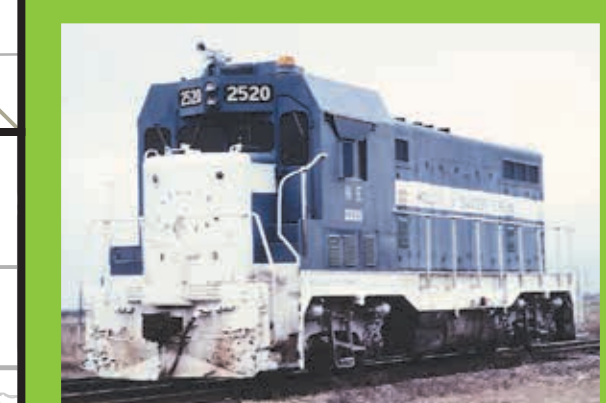
The Hollis & Eastern Railroad, a short line running west from Altus, Oklahoma, was built in 1910 by the Fort Worth & North-western branch of the Katy (Missouri, Kansas & Texas Railroad) that once ran through both the Oklahoma and Texas panhandles.