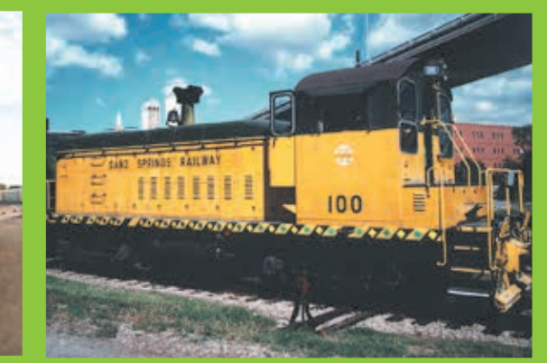
The Sand Springs Railway was built by philanthropist Charles Page, who endowed its passenger profits to the Sand Springs Home for Orphan & Widowed Mothers. It now serves as a freight line from downtown Tulsa to Sand Springs industrial parks.