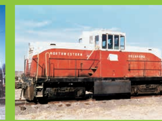
The Northwestern Oklahoma Railroad is a Woodward industrial spur providing oil field suppliers rail shipping across northwestern Oklahoma. The NWO is one of the last sections of MKT tracks that ran from Texas across the Red River to the tip of the panhandle.