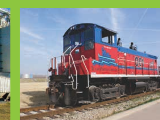
The Tulsa Port of Catoosa began operation on the Verdigris River, the headwaters of the Arkansas River Navigation System, in 1971. Switching engines move cars to the loading platforms where large cranes work the barges. The BNSF and SKOL provide rail access.