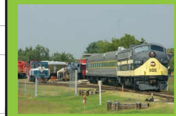
The Oklahoma Railway Museum in OKC has working train engines, passenger cars and cabooses. Their rail memorabilia collection is kept in a 1905 train station. Open free to the public, they offer rides for a fee on alternate Saturdays in April thru August.