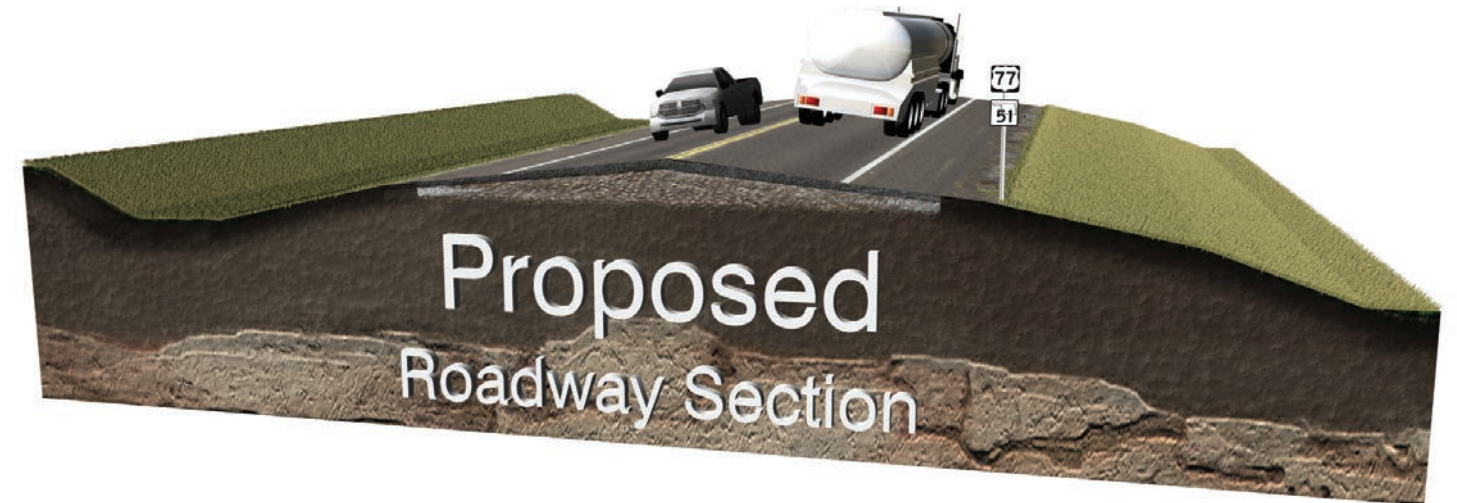
2-LANE TYPICAL SECTION

The Oklahoma Department of Transportation (ODOT), in cooperation with the Federal Highway Administration (FHWA), is proposing to improve SH-51 over East Beaver Creek and the SH-51/US-77 Junction in Logan County. The existing bridge on SH-51 over East Beaver Creek is considered structurally deficient and the existing SH-51 roadway has sharp curves, no shoulders and limited sight distance at the SH-51/US-77 junction. In addition, the railroad bridge's vertical clearance over SH-51 does not meet ODOT standards.