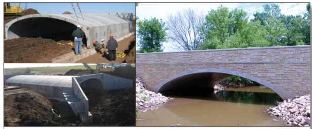
PREFAB CONCRETE BRIDGE REPLACEMENT A typical prefabricated roadway running across a creek, river, or other roadway.