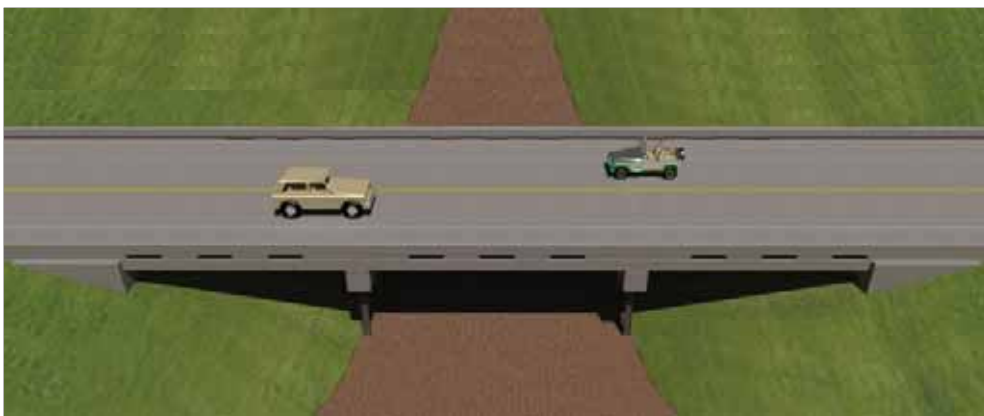
TYPICAL BRIDGE REPLACEMENT A typical undivided roadway running across a creek, river, or other roadway.

The Purpose of this project is to improve the safety and functionality of the US-64 corridor just East of Nash, OK