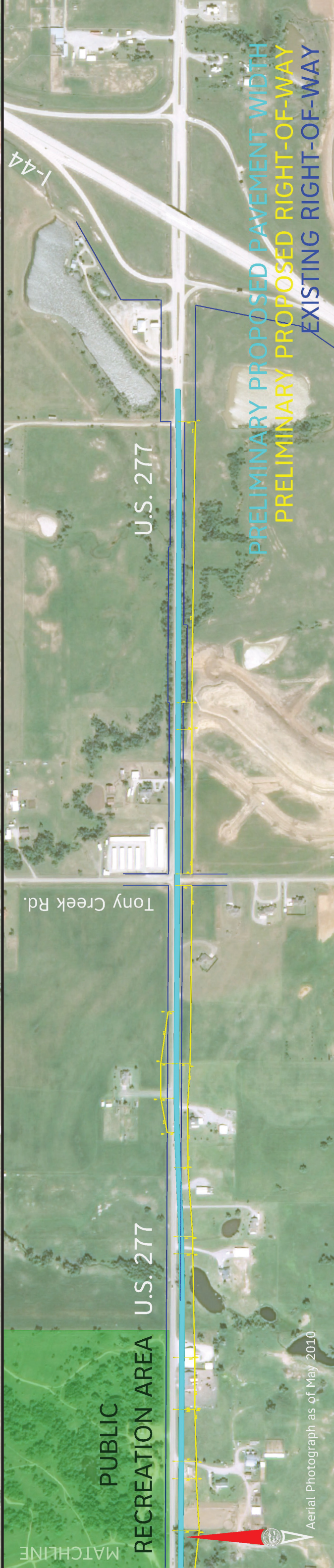
Aerial Photograph as of May 2010

PRELIMINARY PROPOSED PAVEMENT WIDTH PRELIMINARY PROPOSED RIGHT-OF-WAY EXISTING RIGHT-OF-WAY