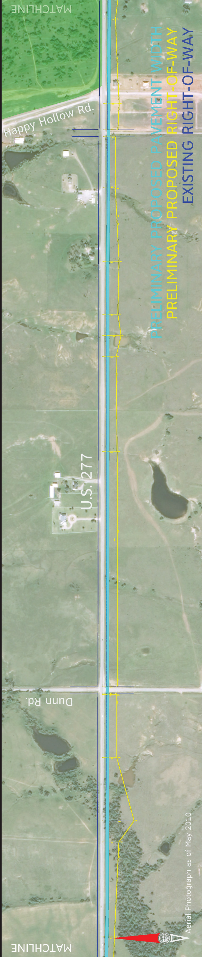
Aerial Photograph as of May 2010

PRELIMINARY PROPOSED PAVEMENT WIDTH PRELIMINARY PROPOSED RIGHT-OF-WAY EXISTING RIGHT-OF-WAY