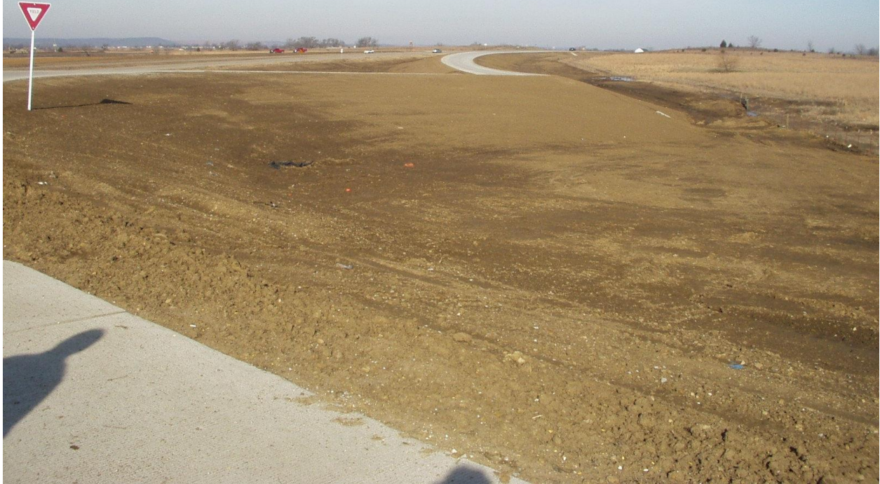
Figure 220:2. Photo. Completed Slope Prior to Stabilization

These completed slopes need to be stabilized before erosion occurs with temporary or permanent erosion control measures.