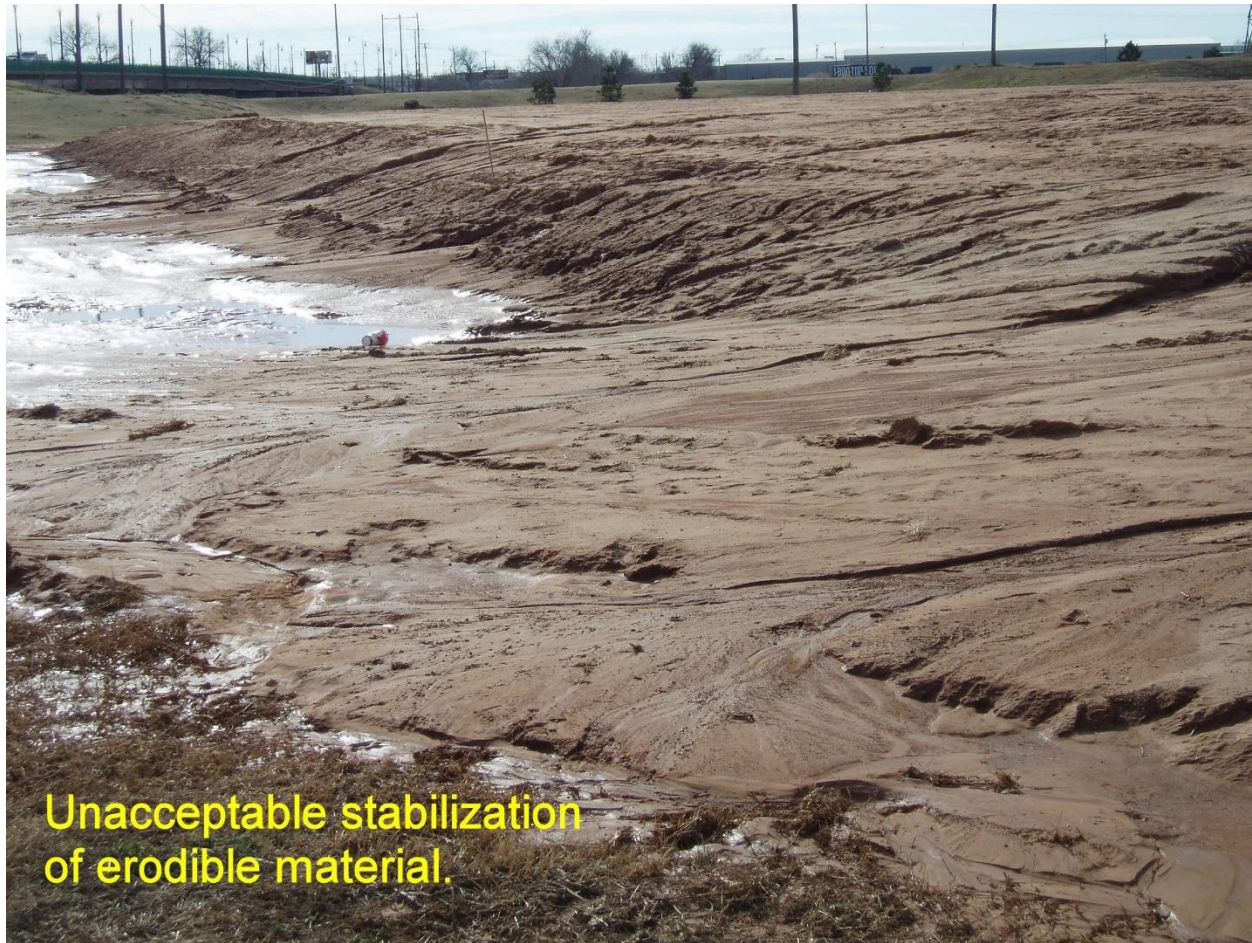
Figure 220:5. Photo. Unacceptable Stabilization of Erodible Material