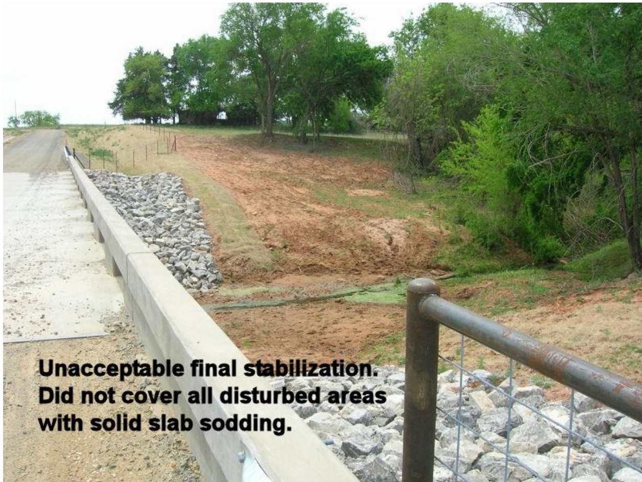
Figure 220:6. Photo. Unacceptable Final Stabilization

Upon completion of the Project, instruct the Contractor to remove temporary erosion and sediment control features that are still in place. Verify that the Contractor's final stabilization efforts are in accordance with the SWPPP, permit requirements, and best practice. For example, Figure 220:6 illustrates unacceptable final stabilization practices.