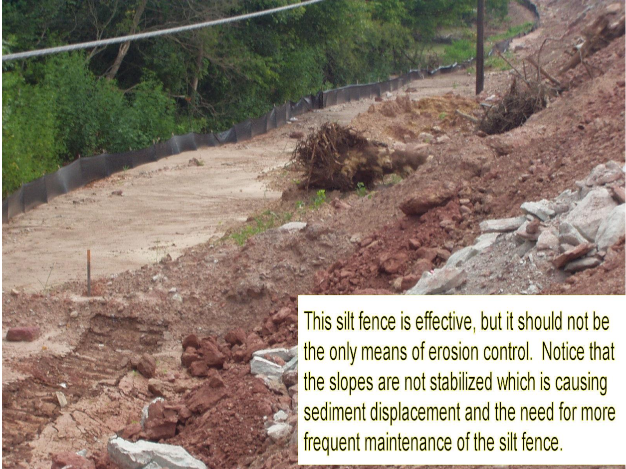
Figure 221:1. Photo. Silt Fence

After installation, the Contractor must continue to maintain the silt fence and provide additional erosion control measures as necessary to prevent the conditions depicted in Figure 221:2.