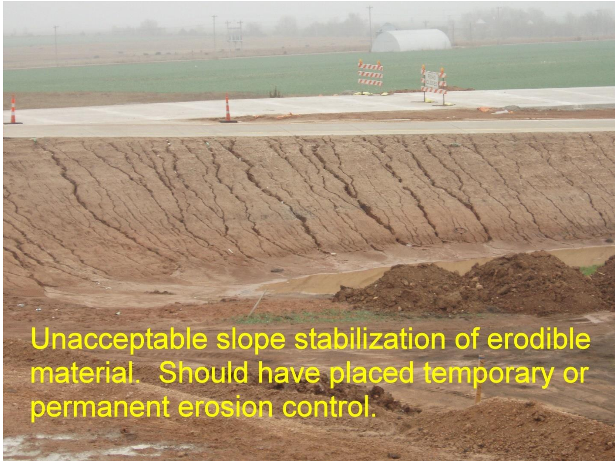
Figure 220:4. Photo. Unacceptable Slope Stabilization

In contrast to Figure 220:3 above, Figure 220:4 and Figure 220:5 illustrate unacceptable conditions that should have been prevented by proper installation and maintenance of effective erosion and sedimentation control measures. Direct the Contractor to repair such damaged slopes as soon as practical.