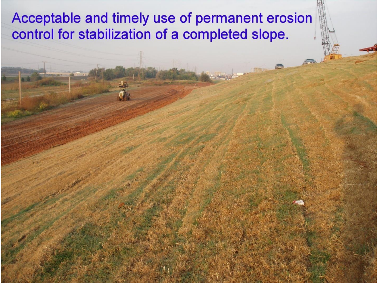
Figure 220:3. Photo. Proper Stabilization of a Completed Slope

Acceptable and timely use of permanent erosion control for stabilization of a completed slope.