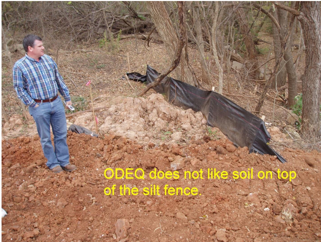
Figure 221:2. Photo. Inadequate Maintenance of Silt Fence