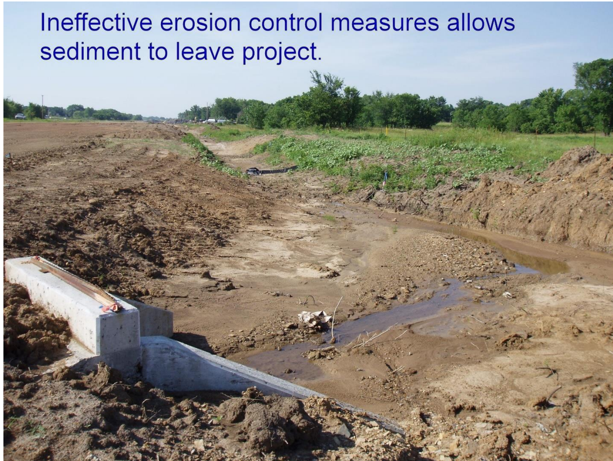
Figure 220:1. Photo. Ineffective Erosion Control Measures

As the work progresses, coordinate with the Contractor to anticipate potential erosion and sedimentation problems and provide timely and adequate controls to prevent or minimize environmental impacts. Figure 220:1 shows the effects of ineffective erosion and sediment controls.