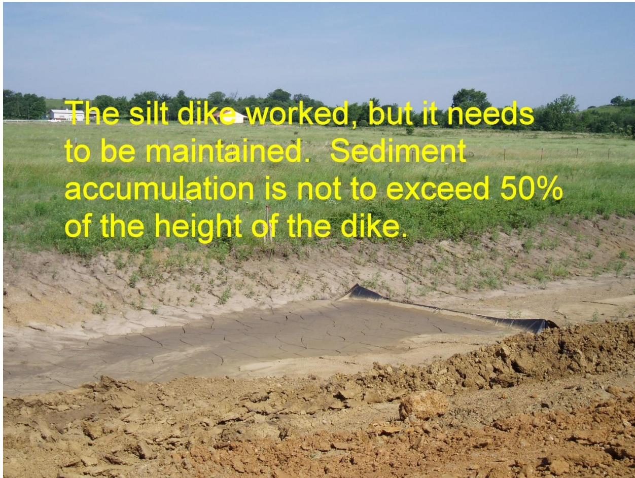
Figure 221:5. Photo. Inadequate Maintenance of Silt Dike