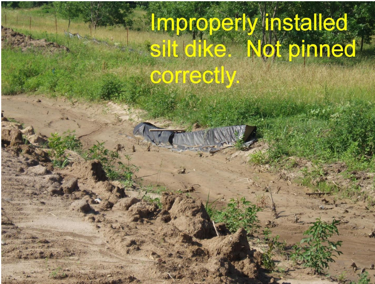
Figure 221:3. Photo. Improperly Installed Silt Dike

Evaluate the location of the dikes to ensure their effectiveness at controlling runoff. Because they are too short, the silt dikes shown in Figure 221:4 below will not effectively control runoff. Silt dikes should be installed so that water flows over the center, and not around, the dike.